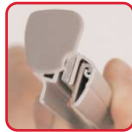
Universal gripper/ self-adhesive top rail

The 33" BARRACUDA is a premium, single-sided roller banner. Features include a graphic tensioner, quick change graphic system and telescopic pole (which conveniently stores in the base of the unit). EVA molded carrying/storage bag is included. This single sided roller banner has been specially designed for maximum convenience with dimensions of 33" wide x 87" high and a weight of 9.92lbs for ease of transport.