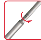
Telescopic Pole (Twist & Lock)